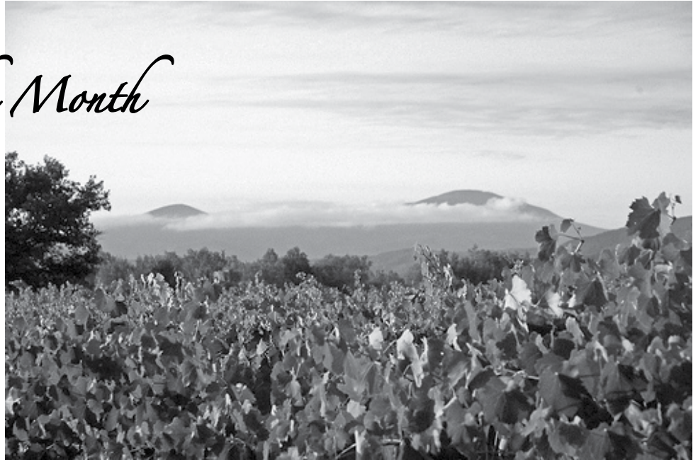
View from Sassotondo Vineyards