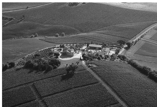
Ciu' Ciu' Winery surrounded by its vineyards

Passerina is a little known white grape that is planted mainly in the Le Marche region. The Ciu' Ciu' 2010 Evoie, produced from organically farmed fruit, is elegantly fresh with aromas of flowers and herbs. Serve chilled with appetizers and delicately flavored main courses like oven-baked trout stuffed with onion, lemon, and parsley.