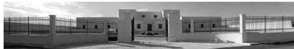
WINERIES from cover

Dry and crisp on the palate, this Cantele Rosato is 100% Negroamaro. The wine has intense fruity aromas with hints of strawberry and cherry and is a perfect warm-weather wine, suitable for appetizers, entrée salads with grilled chicken and salmon, and pasta primavera. Rosé is made like white wine, except that with white wine, the juice is immediately separated from the grape skins, which would otherwise give it color. But for rosé, the juice is left for a short time with the skins, just long enough to give it a tinge of color before fermentation. Red wine is fermented with the skins, which give it its dark hue. Serve rosé chilled like white wine.