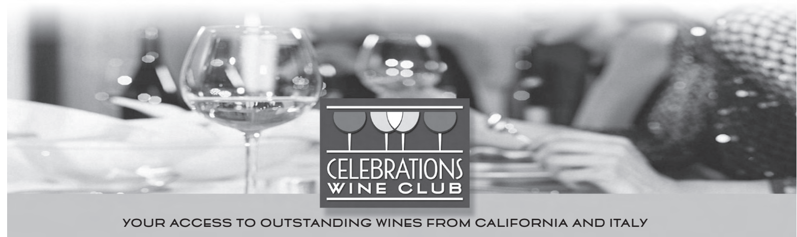
YOUR ACCESS TO OUTSTANDING WINES FROM CALIFORNIA AND ITALY